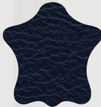
Medal Royal 2013