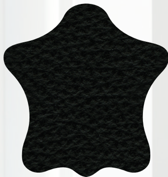
Medal Black 2016

A premium range of super soft leather in a range of colours to suit your branding and corporate decor.