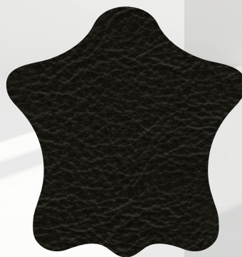
Medal Dark Brown 2021