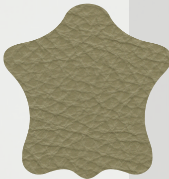
Medal Beige 2002