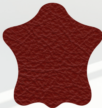
Medal Red 2015