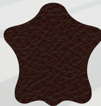
Medal Burgundy 2011