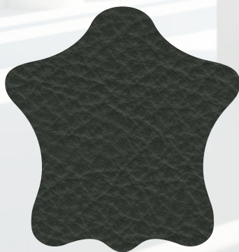
Medal Elephant 2008