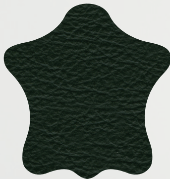
Medal Forest 2004